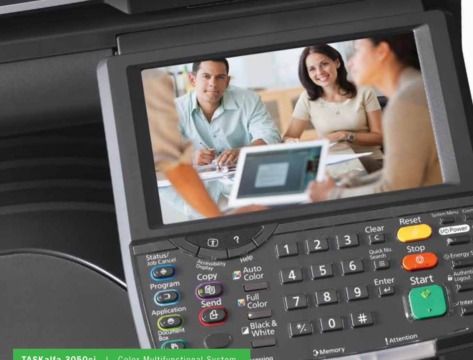
TASKalfa 3050ci | Color Multifunctional System

Powering Color Performance... Company-wide.