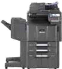
Shown with optional 175 sheet DSDP, 1,500 x 2 sheet paper trays and 1,000 sheet finisher