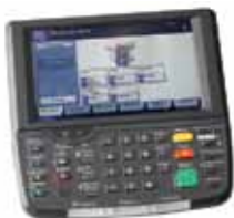
Newly designed, easy-to-use large color touch screen control panel