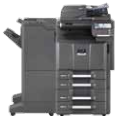
Shown with optional 175 sheet DSDP, 500 x 2 sheet paper trays and 4,000 sheet finisher